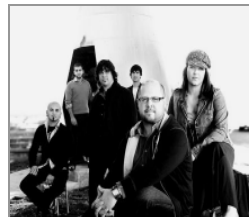
Pocket Full of Rocks

Lunch is also provided with the admission ticket. Tickets are $20.00 per person until September 1. After September 1, the price of the individual tickets is $22.00. You will receive $2.00 off the price of each ticket if you phone in your order (1-800-965-9324) and use the password “West Ohio”. This discount is not available from the website (ITickets.com.) Please note that those ordering ten or more tickets at a time always get them for $20.00 at any time. General admission tickets are also available to the concert for $12.00. There is a $3.00 handling charge for each ticket.